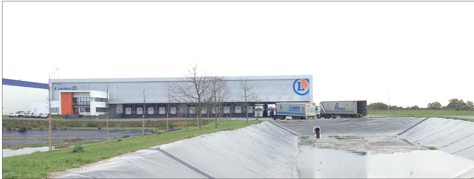
VUE 01 - PC8