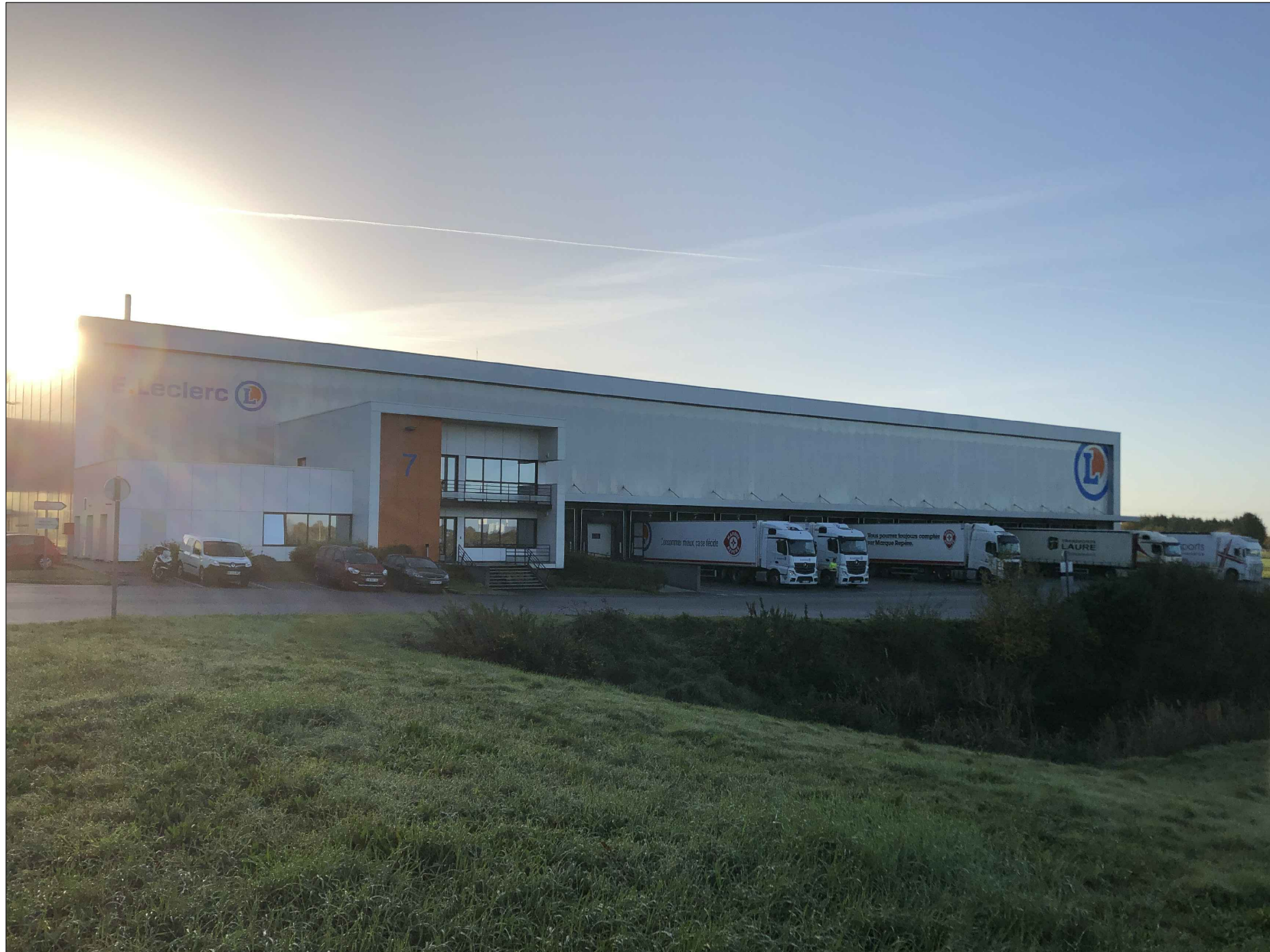
VUE 02 - PC7