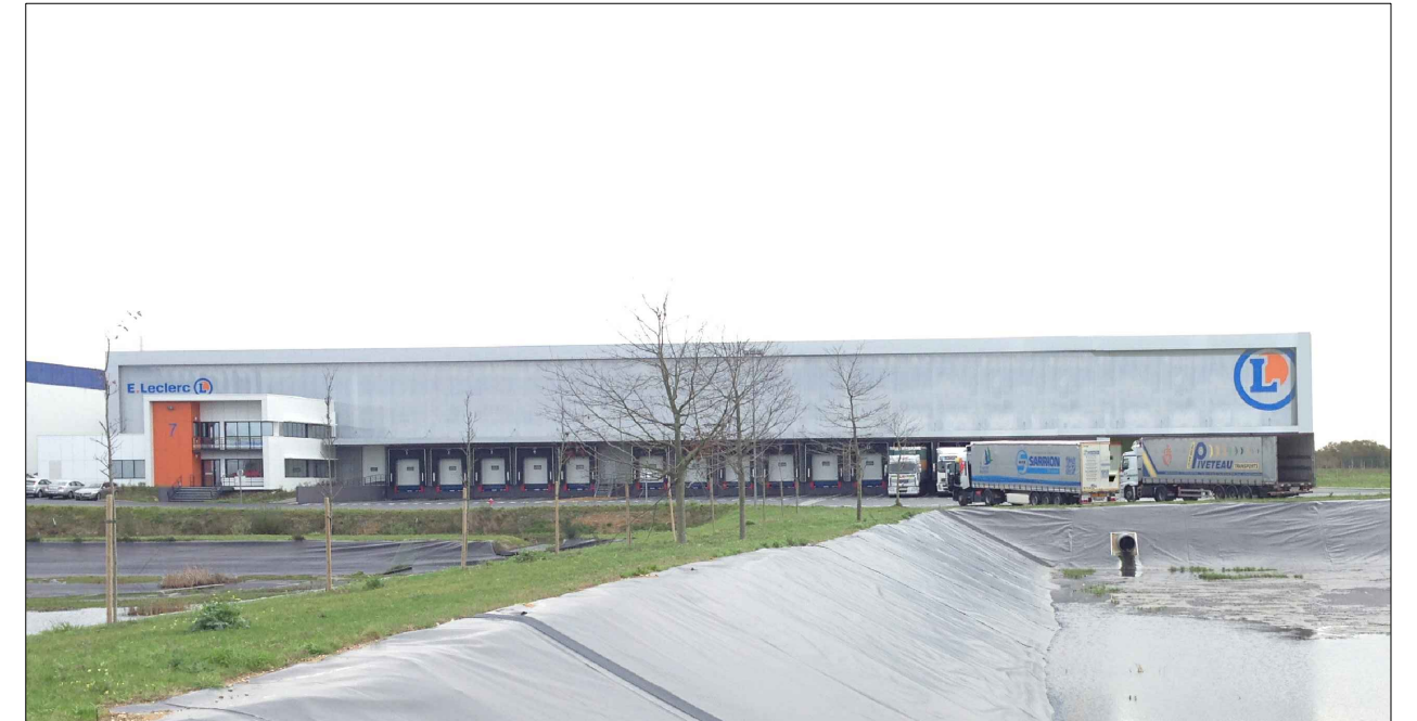
INSERTION VUE 01 - PC6